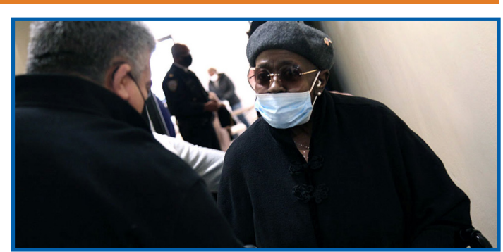
The DA meeting with seniors in Clinton Hill

In each case, the victims allegedly received a phone call from an individual who claimed to be an attorney and said that the victim's grandchild was arrested and being held in jail. The victims were told to provide cash in an envelope to bail out their grandchild and that a messenger working for the attorney would come to the victim's home to pick up the envelope. The defendant, who allegedly worked as a dispatcher, then sent a courier to pick up the envelope and deliver it to him.