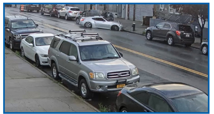
The defendant was allegedly driving over 60 miles per hour when he lost control of his Nissan 350Z and fatally struck the victim

"This horrific crash was no accident - it was a preventable crime