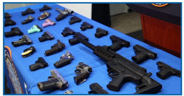
NYPD detectives purchased 44 firearms, including two assault weapons, during their yearlong undercover operation

Bringing these defendants to justice required an extensive, dangerous year-long investigation between