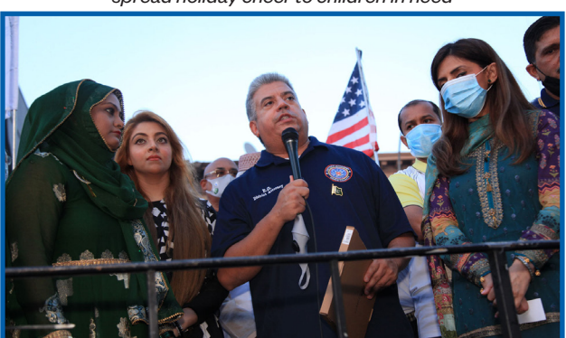
Celebrating the Independence Day of Pakistan with Brooklyn's vibrant and growing Pakistani-American Community