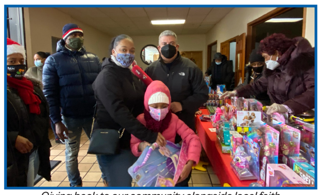
Giving back to our community alongside local faith and community groups to distribute toys and spread holiday cheer to children in need