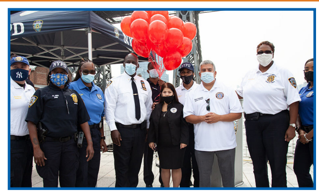
Honoring the memories of lives lost to homicides and supporting victims' loved ones on the National Day of Remembrance