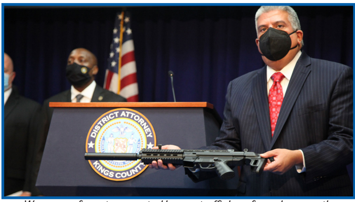
Weapons of war, transported by gun traffickers from down south, have no place in our communities

October 2019 and October 2020. During that time, undercover detectives purchased 44 firearms, including two assault weapons, during 27 controlled gun buys a block away from one of the alleged ringleader's Brownsville home.