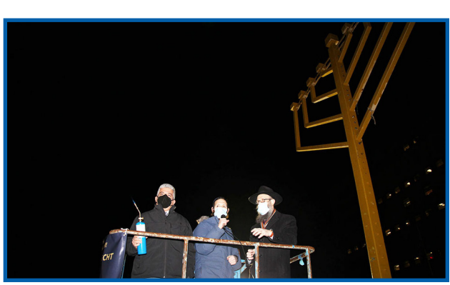
Lighting the Hanukkah Menorah outside Borough Hall, a time-honored tradition that reminds us that darkness can never overcome light